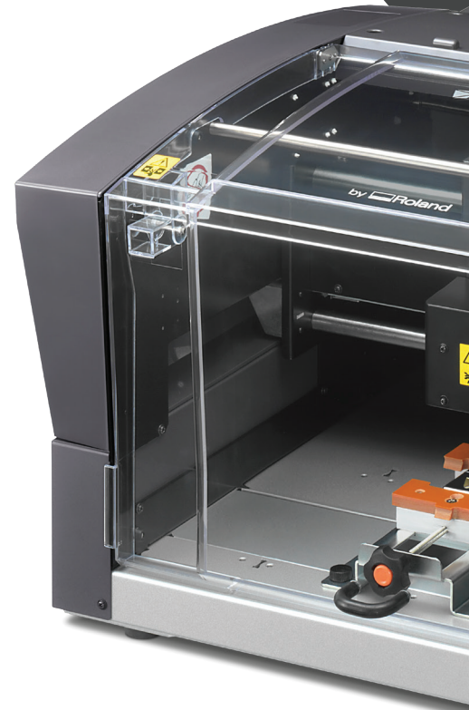
*Optional vice shown

Easily-applied nose cones avoid scratches to delicate materials and deliver consistently precise results.